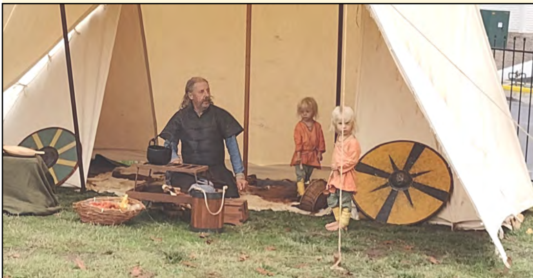
Festival Viking Encampment, not a homeless enclave.