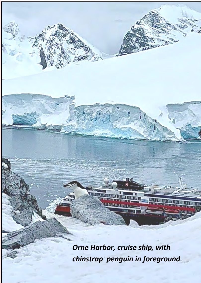
Orne Harbor, cruise ship, with chinstrap penguin in foreground.

I was sitting at breakfast on the second day of a still shaking Drake Passage, when crash, a huge wave hit the ship. The Christmas tree in the crew dining room went flying, along with chairs on tables, glasses and bowls, drawers in Reception, a pretty good mess all over the ship, but no one injured. It may have been the same Rogue Wave that sent two ships back to Ushuaia with broken guest cabin windows and one fatality when a woman got hit with flying glass. The M/S Fritjof Nansen , my “home,” is a new solidly built hybrid ship and she suffered no structural damage.