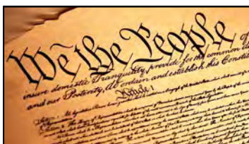
An historic Membership agreement.

* Not at usual Harding Masonic Lodge venue.