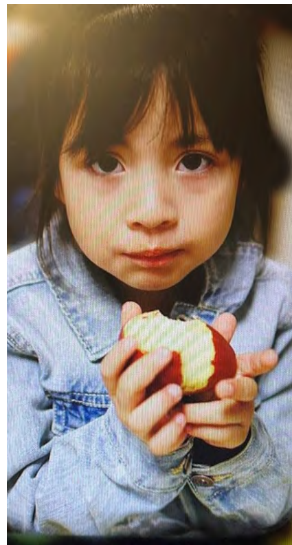
Food Bank photo

Members will be informed of the recommended amounts and be asked to vote up or down on this list at the Julebord.