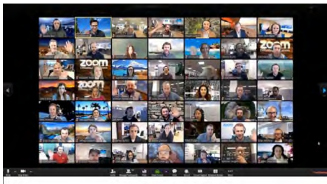
Expected convention screen #1 of 45.

The International Board of Directors met on February 9, 2022 and, in factoring all relevant fraternal, financial, and COVID-19 related information, made the difficult decision that the 2022 International Convention will be held virtually for all delegates and members. This means that the elections for the International Board will still be conducted virtually in 2022 and therefore the districts should be electing their delegates to the International Lodge.